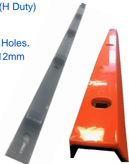
Poly-Coated Clamp Bar & Hold Down Bar

Christchurch 0800 880 233 sales@advanced-eng.co.nz