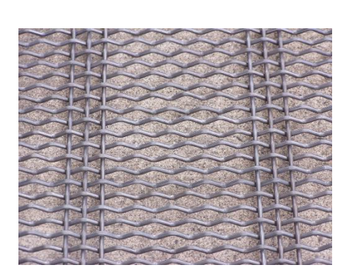
Single Wire Slot